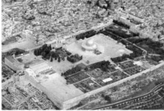
المسجد الأقصى وما حوله ما زال ينتظر الرجال