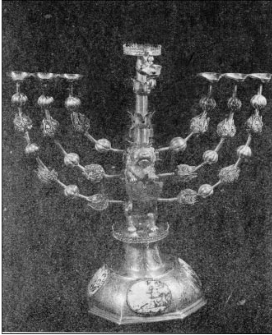
(الشمعدان) فروع سبعة، ترمز لأيام الخليقة السبعة تم انجاز شمعدانات جديدة ويجرى البحث عن القديمة لإكمال طقوس الهيكل الثالث إنه الرمز الرسمي لدولة (إسرائيل)