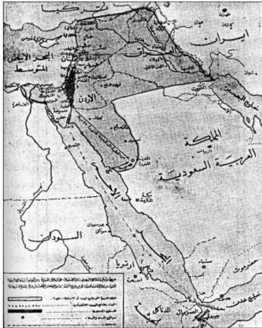
خريطة (إسرائيل الكبرى) كما وجدت في خزائن (روتشيلد) المليونير اليهودي، في أواخر القرن التاسع عشر