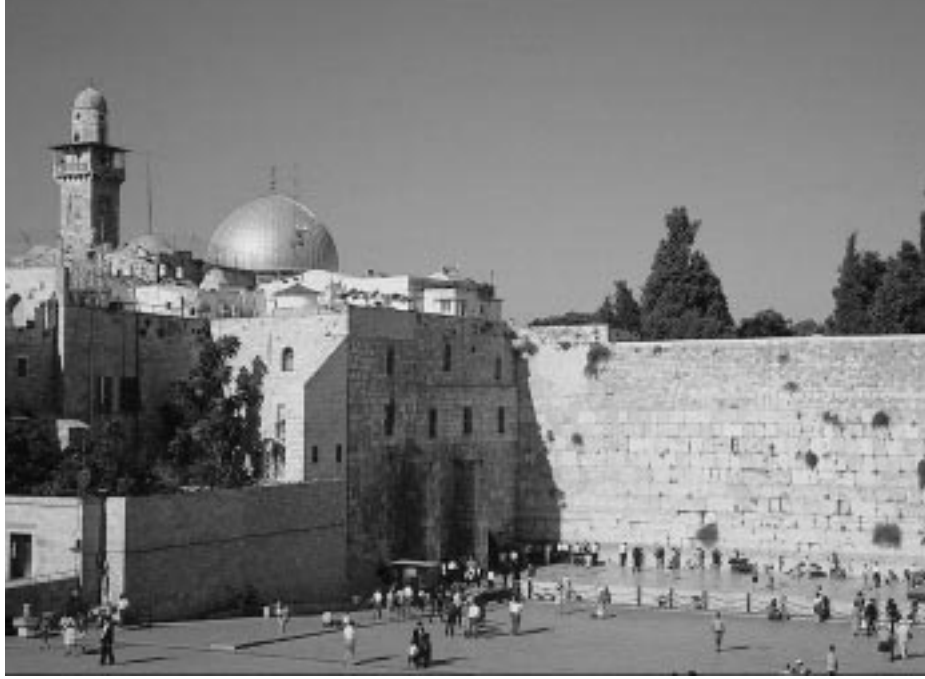
السور القديم من الهيكل (حائط البراق) أو حائط (المبكى) كما يسميه اليهود... إنهم لا يكون فقط !