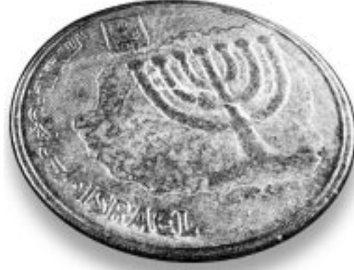
الشمعدان بفروعه السبعة فوق خريطة (إسرائيل الكبرى)

العملات المتداولة بين يهود (إسرائيل) من كل الأعمار والثقافات، تذكّر بالرموز الدينية السياسية