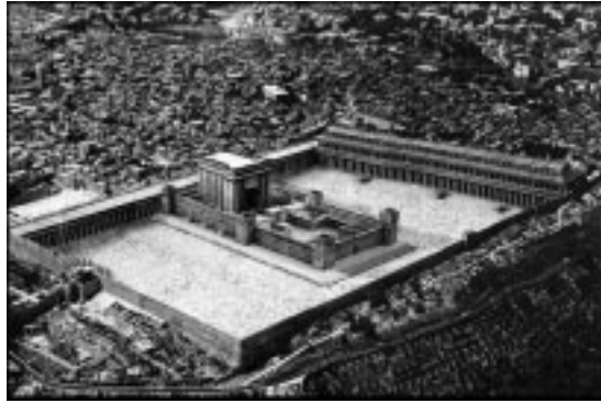
الهيكل الثالث ... قفز فوق المكان والزمان